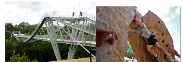
Consol Energy Bridge

SCHEDULE: All are invited to join us at SBR on Sunday afternoon in time for dinner at the Summit overlook. The course begins PROMPTLY Monday morning at 8am . The course will wrap up on Friday evening the 24 th ...but participants may depart at their leisure the next day if desired. Fliers out of Charleston should plan to depart SBR at least two hours prior to flight time.