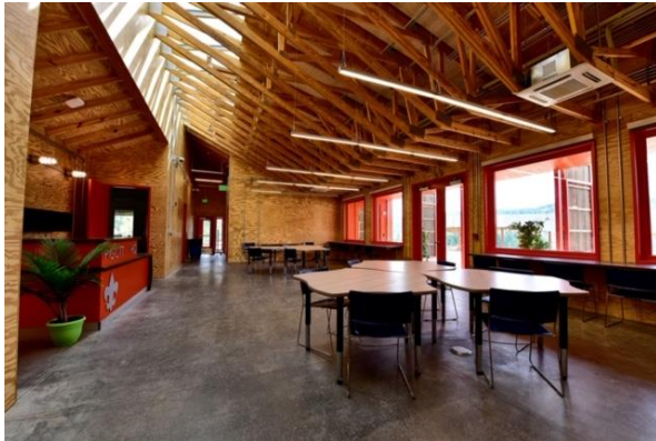
Above: Large meeting room in Pigott Administration building located behind Sub-Camp C at SBR.

The course will be delivered at the Pigott Administration building (below) and brand new dining hall.