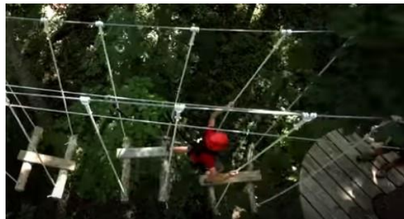
Challenge Course in Action Point