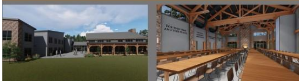
Above: New Dining Hall attached to bunkhouse on left at Pigott, with the Administration building just out of sight to the right of picture.